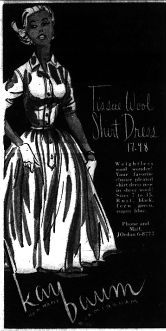
Tissue Wool that Dress 17.98 Weightless and wonderful... your favorite winter-plated skirt dress now in sheer wool! Sizes 7 to 15. Best in black, fern green, open blue. Phone and Mail: Jordan 68-777

EL 6-7300 FEDERAL HARDWARE SUPPLY Open THURSDAY, FRIDAY evenings SOUTHFIELD RD.