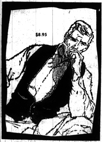
true Continental! leather-trimmed! the Scotport in bulky Orlon and Lambswool