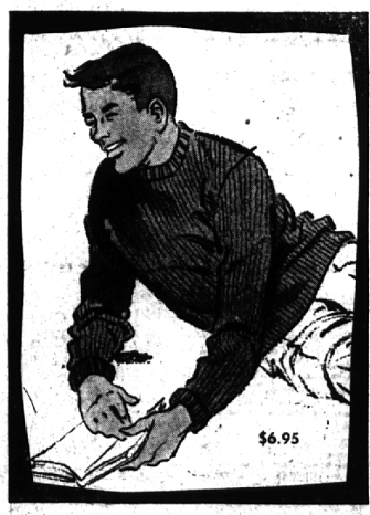
young men like BULKY sweaters! we suggest our Bo Scotmoor

Just take a look at that bulky rib stitch, that broad-chested styling. Note the leather edging... true Continental flair! This is a real man-sized idea in a sleeveless three button cardigan. Shows the fashion-genius that has made Puritan famous! Wonderful colors, too, in that warm, husky Orlon and Lambswool!