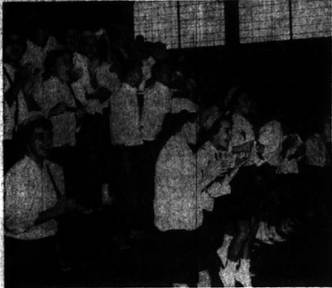
Junior class members cheer their teammates in the relay races.