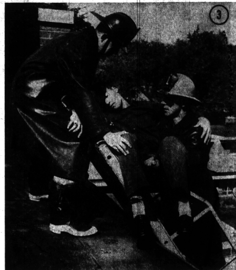
Injured fireman is in position for descent.