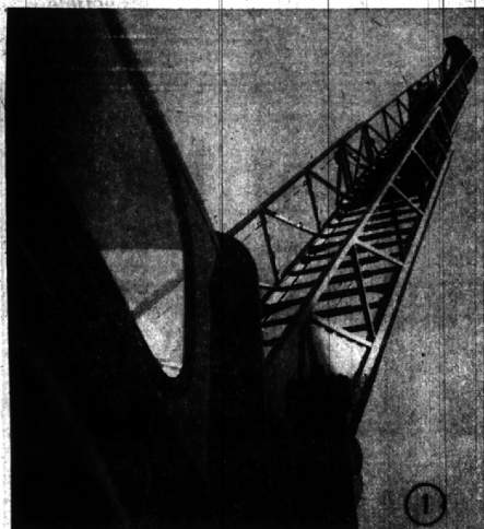
The aerial ladder swings into place.