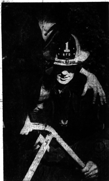
Half-way down the ladder. This is how it's done.

One of the most crucial aspects of a fireman's job is rescue work, as important, if possibly not more so, than actually combating a blaze.