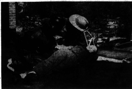
On roof, two-man rescue operation begins.