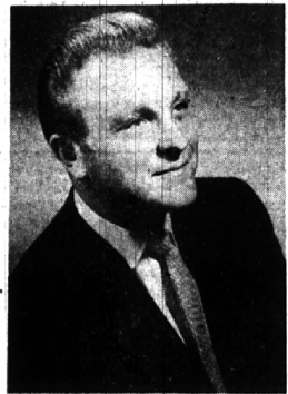
"The Best in Photography"