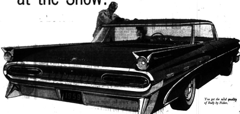
You get the solid quality of Body by Fisher.

Most beautiful change... most dramatic advance at the Show!