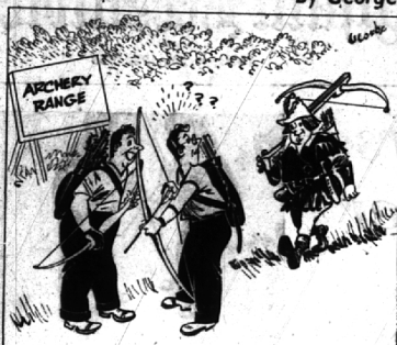
"I'll say this about Smith, our new member. He really tries to get into the spirit of this thing!"