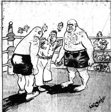
"Now, I want a clean match. Remember—no hair pulling!"