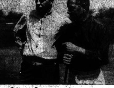
Give Course Once-Over

The national sports and travel show opens in Detroit for five days May 14 at the Light Guard armory on Eight Mile road.