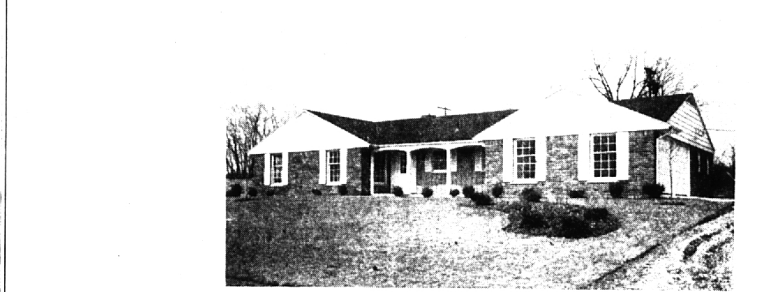
1081 TOPVIEW DRIVE

An ideal home for retired people or those contemplating "taking life easy". It's easy-living features include: compact room arrangement, yet with ample bedroom and family room space when the grandchildren come home. The gracious design, all on one floor, will help mother to maintain the house almost effortlessly. The setting is located in a quiet area typical of gracious country living with city convenience. Large lots provide ample space for those who enjoy gardening. Just one of our many feature-packed ranch type models at prices that will surprise you. Drop out real soon and casually browse through our ranch and split level homes.