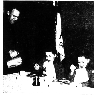
Hey Sambo, Look Here!