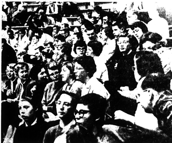
THE FANS . . . were many, and Birmingham was well represented at both the afternoon and evening sessions. These students were just a few of the many who drove to Ann Arbor to cheer the Maple tankers.