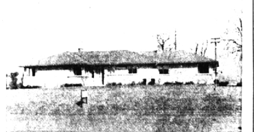
In Hickory Heights

Here's another very splendid offering at a way below Market Price: