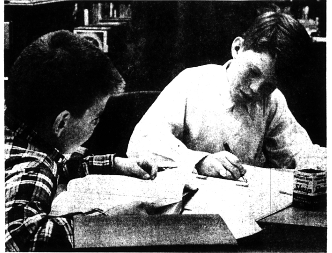
Homework Comes First