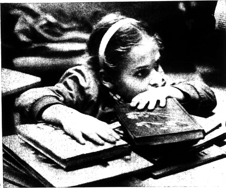
"I Wish Mom Would Hurry"