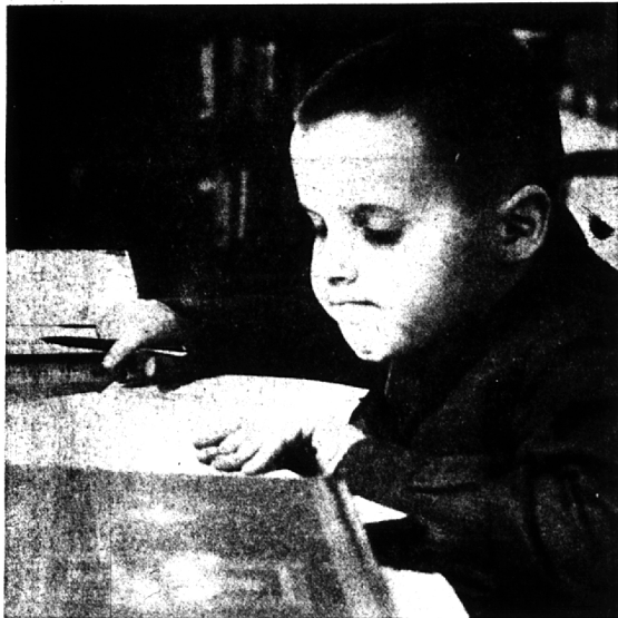
"Let's See Now"