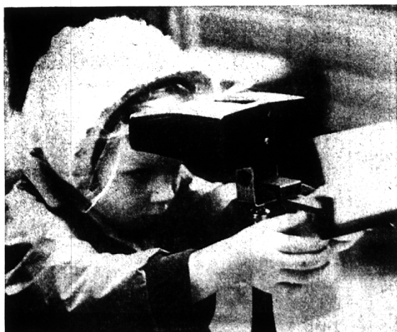
A Sneak Peek