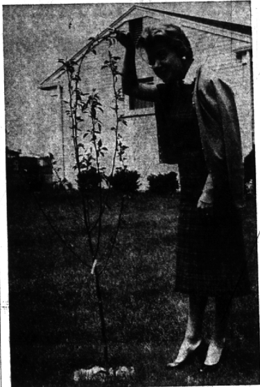
Both 'Tower' Five Feet