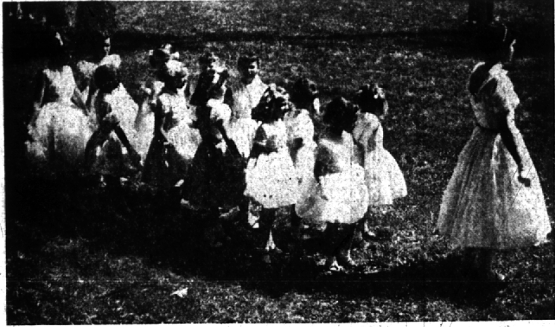
GAILY ATTIRED young dancers await their turn at the Maypole in the festival's colorful opening ceremonies.

AN OLD CUSTOM for spring, dancing around the Maypole, providing many Birmingham youngsters with festival fun.