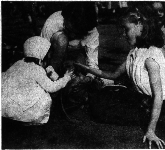
Here's a Charmer . . .

. . . that appeals to all ages. The tawny Birmingham's pet parade recently. little pooch attracted all the girls at Bir-