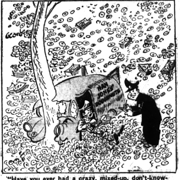
"Have you ever had a crazy, mixed-up, don't-know-where-to-begin feeling?"