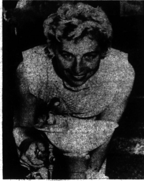
MARLENE BAUER HAGGE