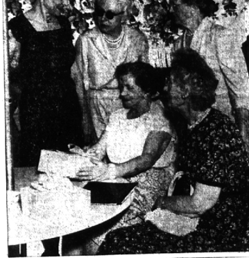
Forest Laker's Outdoor Party