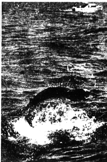
space of two to three seconds with a 35 mm Bell & Howell Paton rapid sequence camera at 1,000 of a second. The first photograph shows the marlin just as it had been hooked by a member of the Bass party. The second and third pictures are during the same jump while the fourth shows the