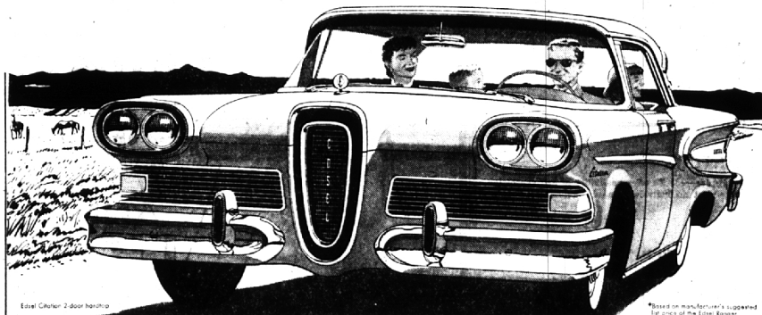
Edsel Chester 2-door hardtop

Exclusive Teletouch Drive Economical 303 and 345 horsepower Big, safe, self-adjusting brakes Single-dial heating and ventilating Luxurious contour seats