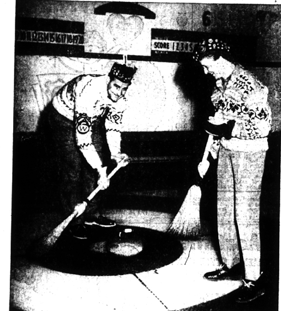
All Part of the Game