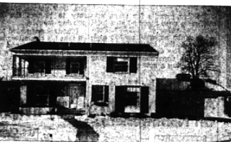
This magnificent gray New Orleans Colonial is on one of Birmingham's finest avenues. Near Quanton School, it's exquisitely finished.