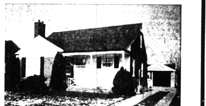
Right in Birmingham, just a short walk to schools, here's a 3-Bedroom home in beautiful condition that can be purchased with $3,100 down.