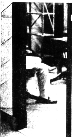
Waiting his turn to be called before the jury, a defendant is glimpsed from the corridor just outside the committee room where all defendants and their parents report on teen court day.