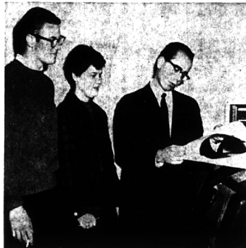
Reporter from Lathrup