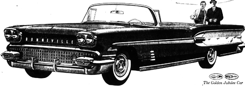
The Golden Jubilee Car

The Boldest Advance You'll See at The Show!