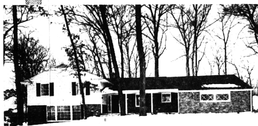
MODEL on ADAMS RD. BETWEEN LONG LAKE & WATTLES

We Specialize in 3—4—5 Bedroom Homes For Growing Families