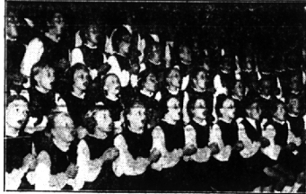
OBERNKIRCHEN CHILDREN'S CHOIR