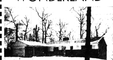
FROM THE STREET