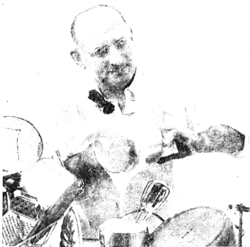
Dishwashing's a cinch with plenty of hot water.