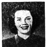
More heat with less work!

SCREENS and STORM SASH FLUSH DOORS • Combination Doors and Windows • Cupboard Doors and Drawers • Plywood-Kill Dried Lumber 1184 Grant MI 4-0424 WOODCRAFT CO.