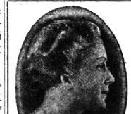
Face and Feature Corrections