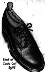
Block of Cordo Call $9.95

Hi, Son! Now you can have shoes just like Dad's!