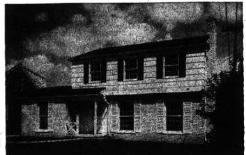
1055 DONMAR COURT (North of Lincoln between Larchlea & Pleasant)