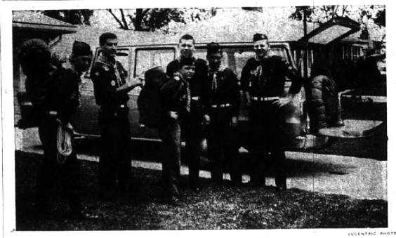
It's Westward Ho for Explorer Scouts