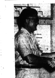
Missions and aircraft may change for Michigan's 403rd Reserve troop carrier ("boxer") Wing but not its flying skill.

Proof came in the form of a continental air commander "meritorious achievement award" for flying more than 4,100 hours without an accident in the six months ending July 1.