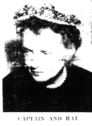
CAPTAIN AND HAT