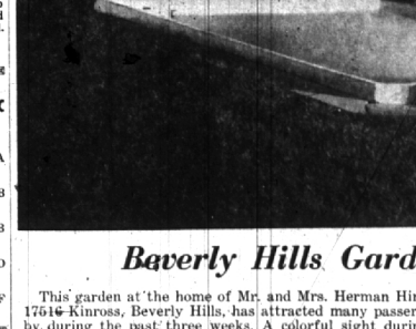
Beverly Hills Garden Beautiful at Night