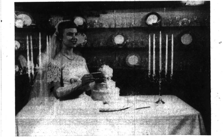
Pictured above: A portion of the Crystal and China room at Lakes' Jewelers