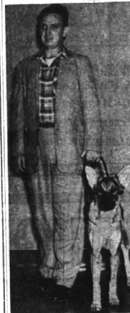
Gift of Hills Man

p.m. last Thursday. Police said entry was gained by breaking the lock on a door from the garage. Loot included a stove, vacuum, and iron, dresses, dishes and pots and pans.