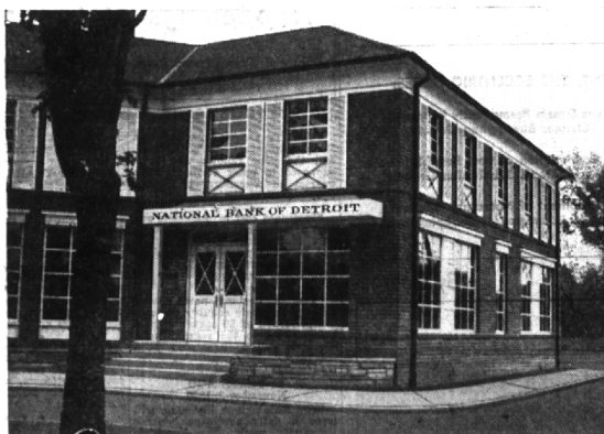
WEST MAPLE-CRANBROOK OFFICE

More friends because we help more people