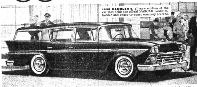
Rambler Cross Country Station Wagon, above, is one of 11 all-new Rambler 6 and Rambler Rebel V-8 models for 1958

NOW—With All-New Jet Stream Styling, All-New Pushbutton Driving... Choose from 17 Models... Two Wheelbases!