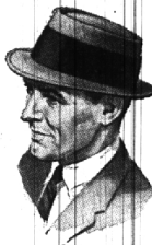
THE STETSON FRANCONIA