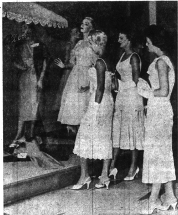
Dolls and Dolls