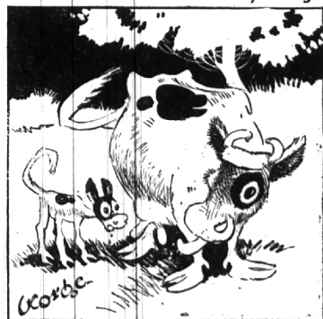
"This warm milk all the time! How about some ice cream?"