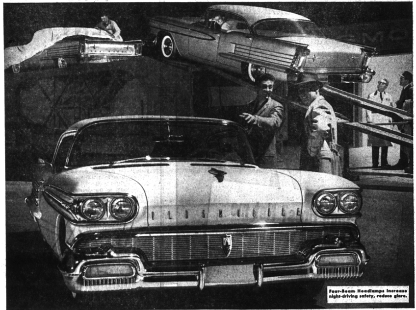
Four-Beam Headlamps increase night-driving safety, reduce glare.

... THE NEW WAY OF GOING PLACES IN THE ROCKET AGE!