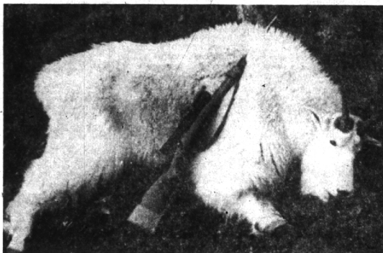
The fur of a mountain goat is comparable to angora, Wilson reports. He shot this beautiful trophy, one of eight such animals taken by the party. Average weight of the goats was 300 pounds. Most of the hunting on the trip was done above timberline. The Canadian wilds were in their finest fall colors for the first two weeks of the hunt. Snow fell the final week and the temperature dropped to three above the last day.