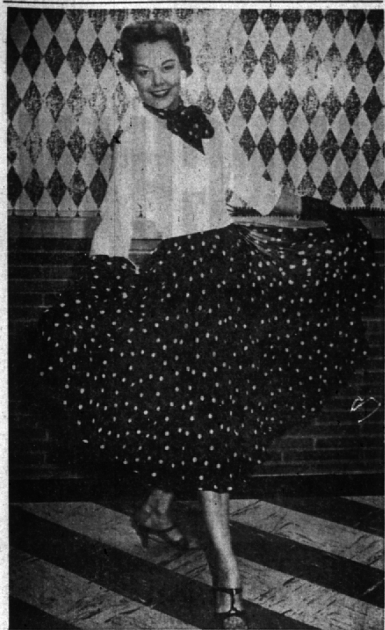
ONE OF THE NEWEST FROCKS of the season shown Tuesday for Birmingham and Bloomfield Hills women at Kingsley Inn was a Samuel Roberts original of black-silk chiffon. Coin-dots pattern the bouffant skirt; . . . three skirts for fullness . . . worn with an imported white kidskin bolero. A chiffon scarf to match the skirt was tied around the neck. Models from Scholnick's of Washington boulevard, intermingled with luncheon guests showing "clothes that are different."