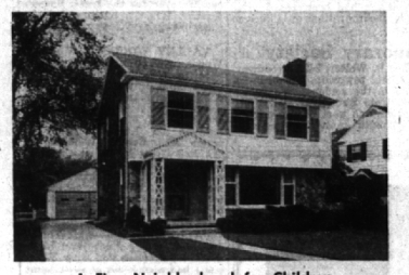
A Fine Neighborhood for Children