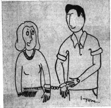
"Does... does THIS mean we're going steady...?"